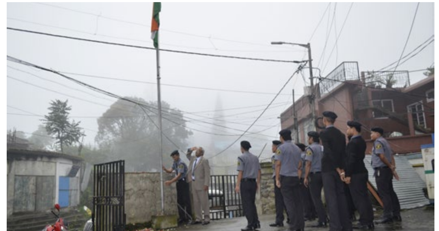
Republic Day, 26th January, 2015

The students of the Institute actively participate in Games and Sports, Cultural and Technical Fests, Quizzes, Debates and other co-curricular and extra-curricular activities. Sport is a compulsory subject for all the first year students.