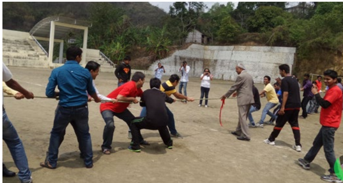
Shaurya: Annual Sports Festival 2014-15